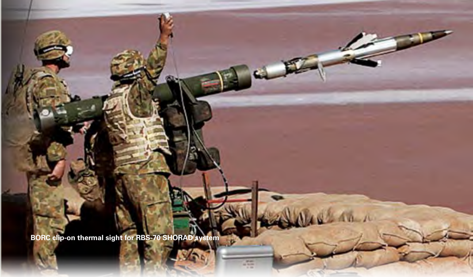
BORC clip-on thermal sight for RBS-70 SHORAD system

FLIR produces a wide range of specialized IR and EO sights which are tailored for integration into specific weapon systems and vehicles, in many cases providing a modern EO/IR upgrade to existing vehicles and systems.