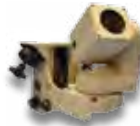
ThermoVision® DVS40 Steerable driver's sensor