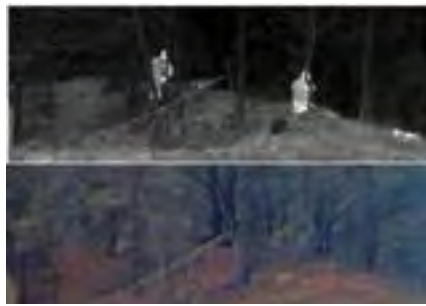
Split screen mode viewing capability