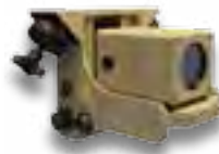
ThermoVision® DV40 Fixed driver's sensor