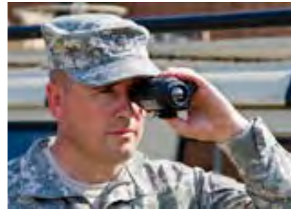
Long-distance laser pointer for missions or short distance for training