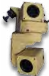
ThermoVision® DV-FADS Independent steerable driver's and observer's sensors

FLIR's family of vehicle vision sensors offers driver and observer IR cameras for convoy lead vehicles, image stabilization and digital detail enhancement, 4x digital zoom, variable speed pan/tilt, ergonomic and easy to operate hand controller, quick release for both driver and observer cameras, and the capability to add a low light-level CCD and/or laser pointer within the existing physical package.