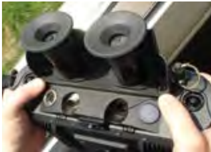
Adjustable eyepieces with bellows eyecups for covert operation

The Recon M24 is a basic, low cost, helmet-mountable, thermal pocket scope for tactical observation and general purpose night vision. Rugged and submersible, the M24 provides a standard 320 x 240 image with optional 640 x 480 capability.