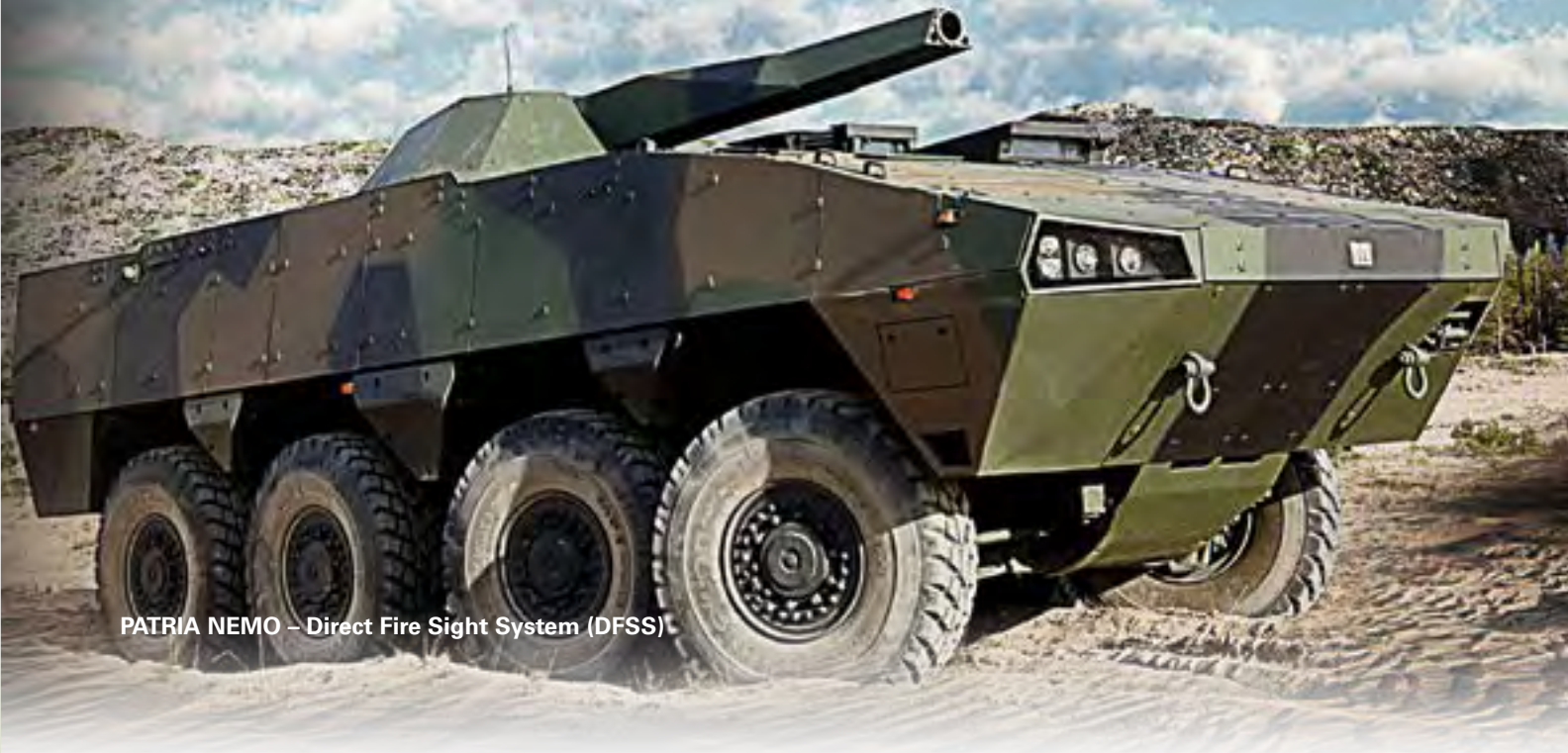
PATRIA NEMO – Direct Fire Sight System (DFSS)

FLIR provides over 40 years of experience in producing targeting sights for a wide array of vehicles and weapon systems. Featuring maintenance-free boresight retention and high sightline stability over the full range of operational environments, FLIR offers a complete range of high performance, cost effective solutions for vehicle manufacturers, weapon system OEMs and end users.