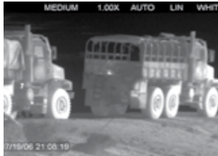
High resolution thermal imagery