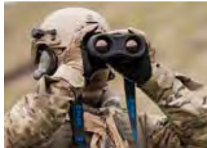
Straight-forward ambidextrous controls allow first-time users to operate proficiently.