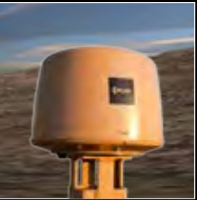
Ranger R2 Mid-range with both FMCW and Doppler capabilities