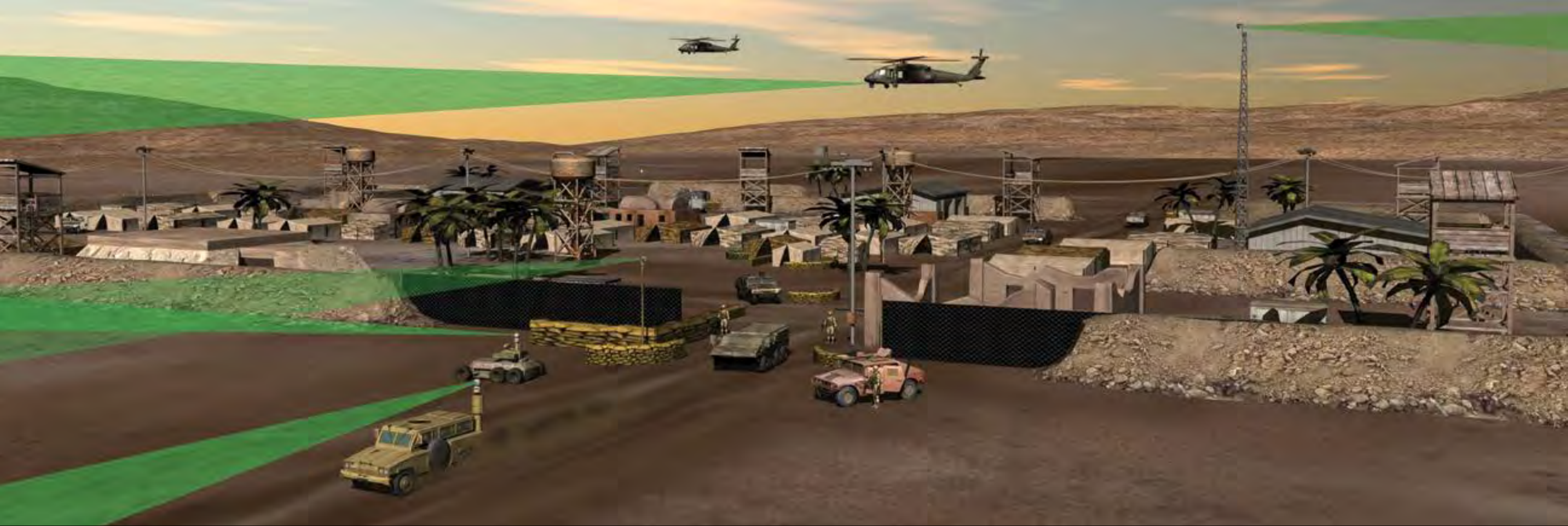
Star SAFIRE LV Mobile long range target location and identification