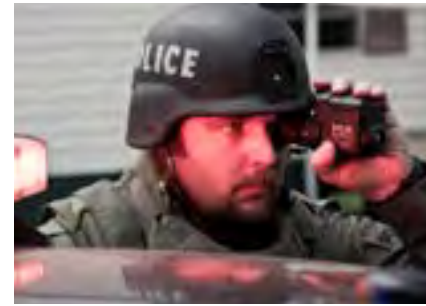
Adaptable for handheld or tripod mount