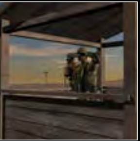
Recon B2-FO Handheld target location and identification