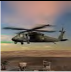
Star SAFIRE III Airborne long range target location and identification

In the past 15 years, we have delivered thousands of uncooled and cooled cameras and radar systems to help secure and protect air and naval facilities, combat and peace-keeping forces, borders and critical infrastructure. In all parts of the globe, day and night, the Soldiers, Marines, Sailors, and Airmen of the U.S., NATO, and allied nations live and work under the security umbrella provided by FLIR Systems. Around the world, integrated base defense operations and other security staff are familiar with the quality, reliability, and performance of our sensors and systems.