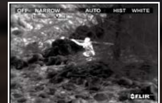
FLIR thermal imaging