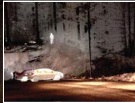
Color TV fused/blended with IR