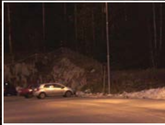
Color TV image

Just a color TV or a thermal camera alone can be a bit limited under some conditions. With FLIR's blended video, the driver has truly a multi spectral view of what is going on. It becomes possible to drive without using headlights and still see whether other vehicles' lights are white or red which in fact is quite important information.